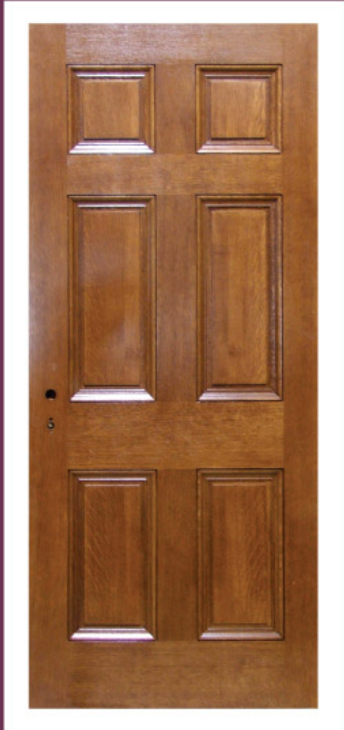
6-panel Maiman door installed in the Washington DC Appellate Court Building