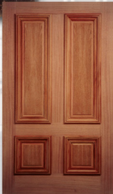
Maiman 60-minute fire-rated replacement door, installed 1997