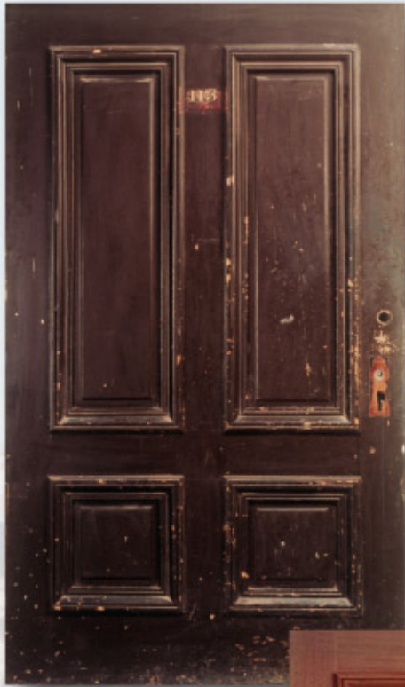
Original door, installed circa 1812